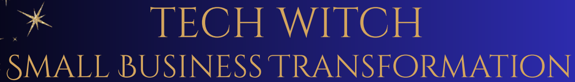
CHART THE COURSE